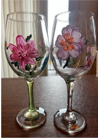
2 hand painted wine glasses